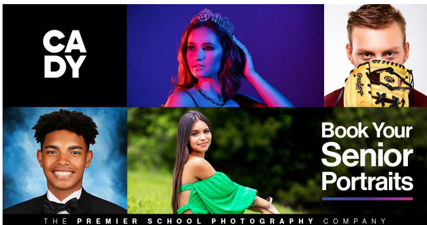
1057 554 px