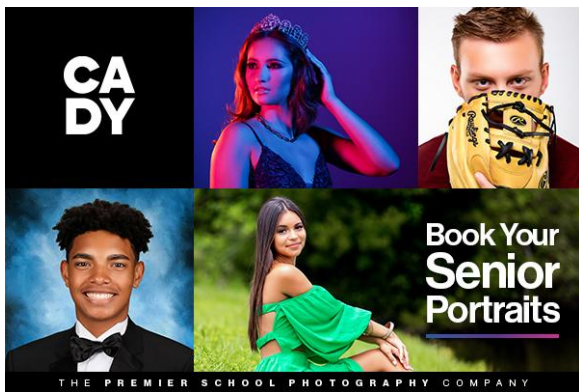
600 x 400 px