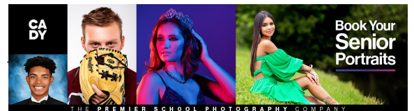
480 x 330 px