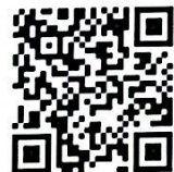
College Rep Visits